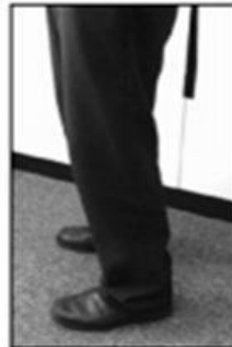
Loose-Fitting Formal Trousers