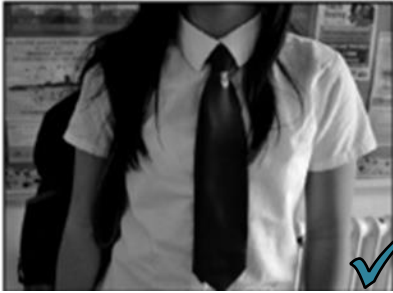
Shirt and Tie